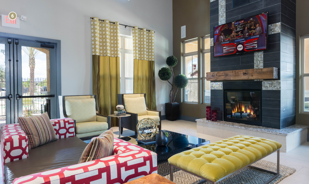
6 Volare LAS VEGAS, NEVADA Big House®