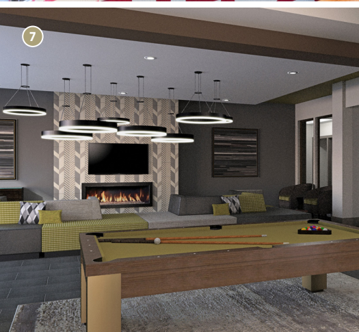
7 Manhasset Club ST. LOUIS, MISSOURI Class A Market Rate