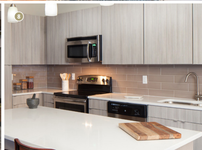
8 Paramount at South Market NEW ORLEANS, LA Conventional Class A Development