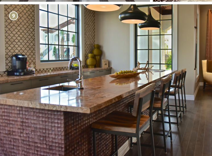
9 The Atlantic Tradition PORT ST. LUCIE, FL Conventional Class A Development