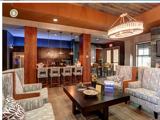
8 Faulkner Flats OXFORD, MS Conventional Class A Development