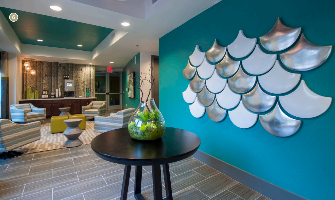
6 By the Park HOUSTON, TX Conventional Class A Development