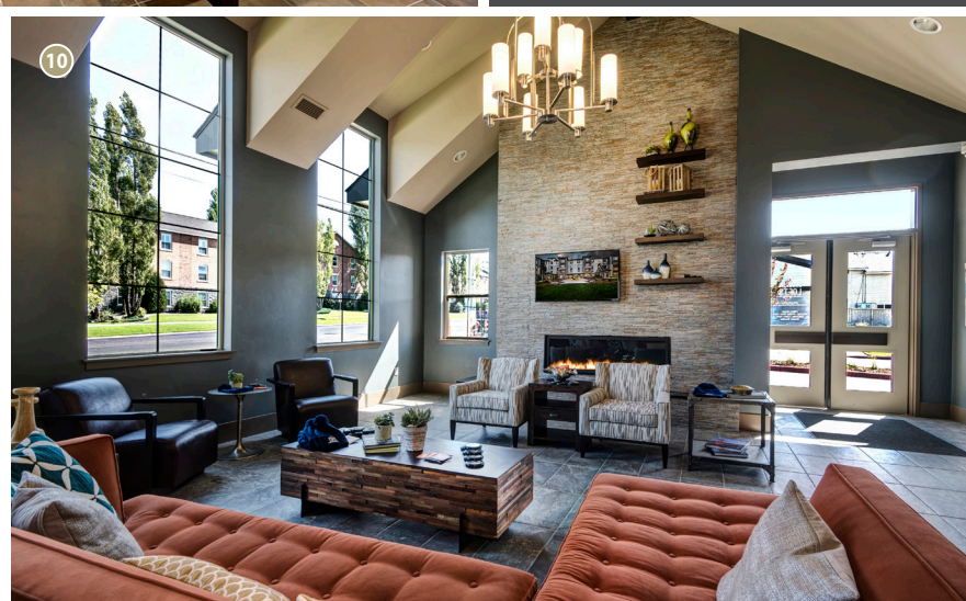
10 Mountain Lofts REXBURG, ID Student Housing